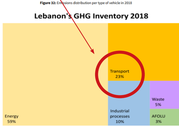
Figure 10: Lebanon's national greenhouse gas inventory by category in 2018