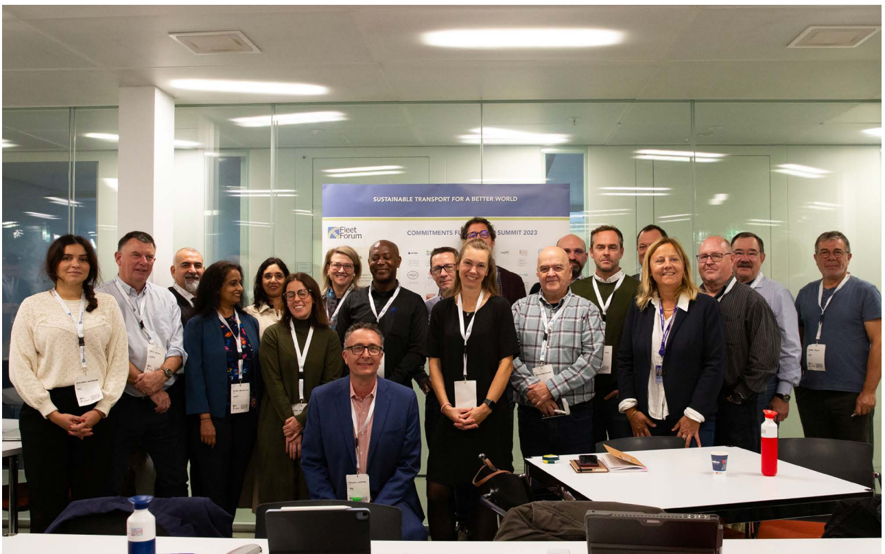
Fleet Forum Summit, October 2023

To learn more about the Fleet Forum member community, click here .